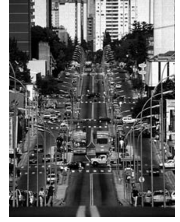
Curitiba, Brazil, View of main artery, showing central dedicated bus lanes that facilitate high-speed surface transit, a less-expensive alternative to an underground subway system.

SR: I'd like to go back to Mexico or to many examples around the world, such as Africa or South America, where the implementation of a culture of change or sustainability has to be enacted at a regional scale. In many cases, the basic needs of a population are not being satisfied, so planning is elaborated more at the level of satisfying primary needs. In such contexts, people can't grasp or understand global environmental problems. So, how would you, as a politician, help a community to understand this cooperation that you talk about?